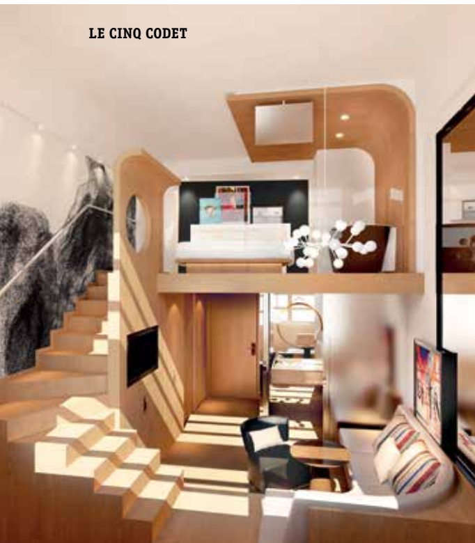
LE CINQ CODET