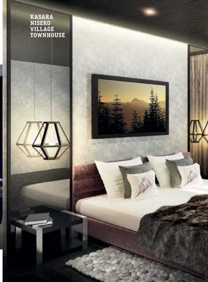
KASARA NISEKO VILLAGE TOWNHOUSE