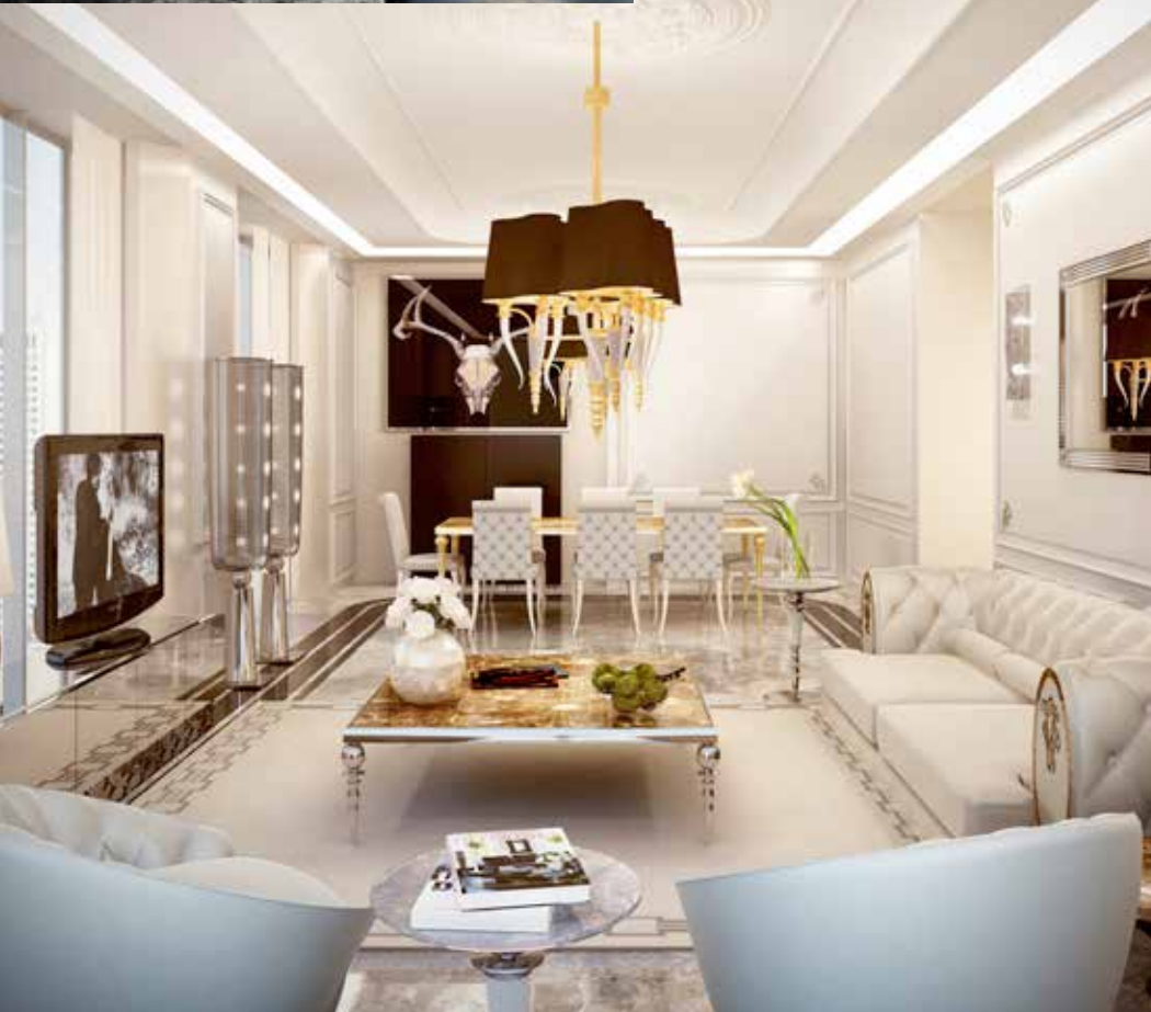
THE REVERIE SAIGON

5 Escape the city buzz and head up to Mekong Villas , the latest member of the Secret Retreats collection. The collection of villas offers an excellent sight of Laos and the Mekong River, while its decor reflects the unspoiled allure of its lush surroundings. The rich local flavours, presented in the rustic architecture and the seasonal menu served up at the villas, make for an idyllic getaway. For leisure, paddle on the expansive Mekong with the canoes available. From THB3,000 (S$118) per night in a log cabin, minimum three nights stay. 96 Moo 6, Leab Mekong River Road, Ban Kok Pai, Pakchom District, Loei Province. Tel: +66 0 2222 1290