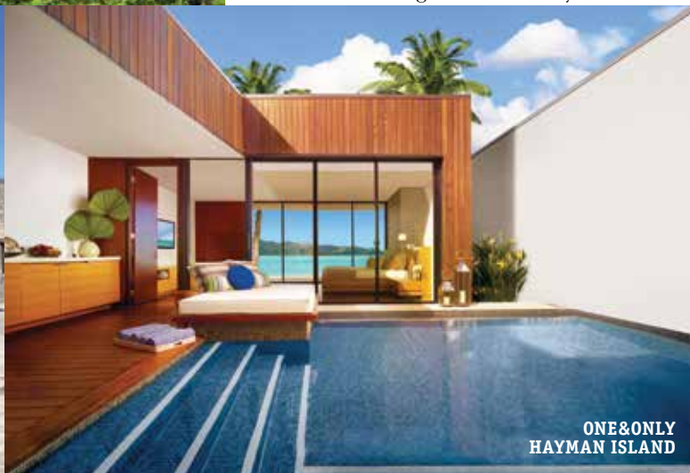
ONE&ONLY HAYMAN ISLAND

per night for a standard room. 19 Avenue Kléber, Paris. Tel: +331 5812 2777